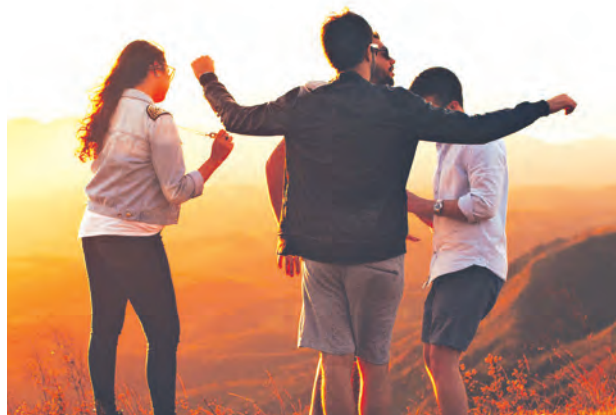
Fig. 4.4 Adolescents in a group