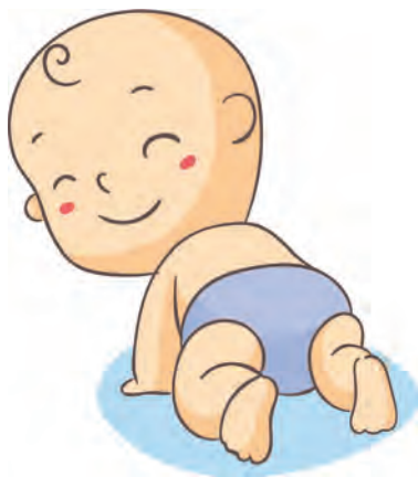
Fig. 4.2 Infant

This stage ranges between 2 week after birth to 2 years. During this stage rapid physical and motor development takes place. Within 2 months child can turn his head. Child can sit and walk with support by 9 months. Child starts walking independently by around 12th months of age.