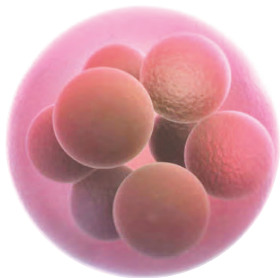
Fig. 4.1 Embryo

At this point, the mass of cells is known as an embryo. This period starts from the third week after conception and continues till the 9th week. It is a time when the mass of cells becomes distinct as a human. The embryonic stage plays an important role in the development of the brain. Almost all the internal as well as external organs are developed by the end of this period.