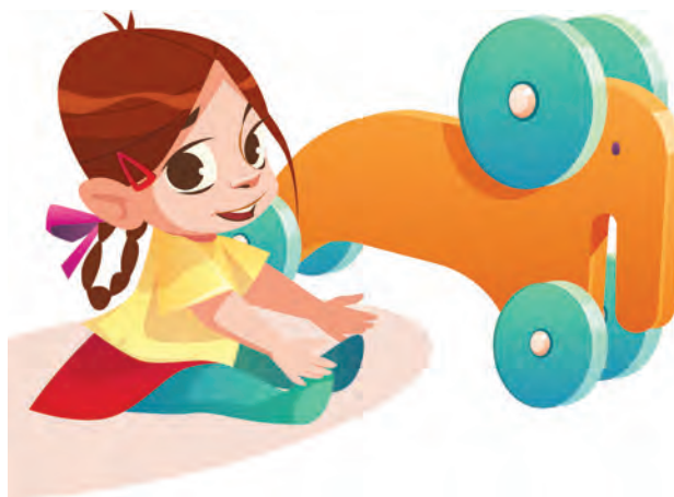
Fig. 4.3 Child in nursery

This stage extends from 2 years to about 6 years. This age is also called preschool age. Child develops control over his muscles. Child becomes physically independent. The physical territory of the child increases, so automatically child learns about social behaviour. Child asks number of questions to others. Hence this age is called as 'questioning age' or the 'age of curiosity'.