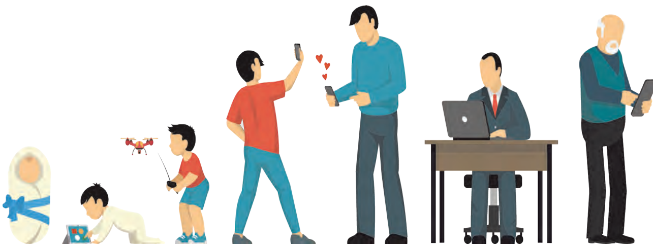
Fig. 4.5 Life span : from infancy to old age